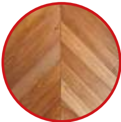
Teak Burma Spine